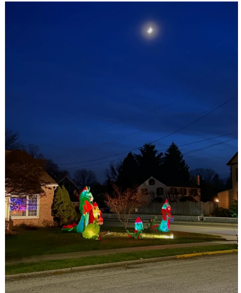
Will the dragons stay up to see the ball drop on New Year's Eve?